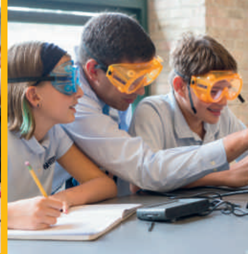
Upper School Grades 5–8