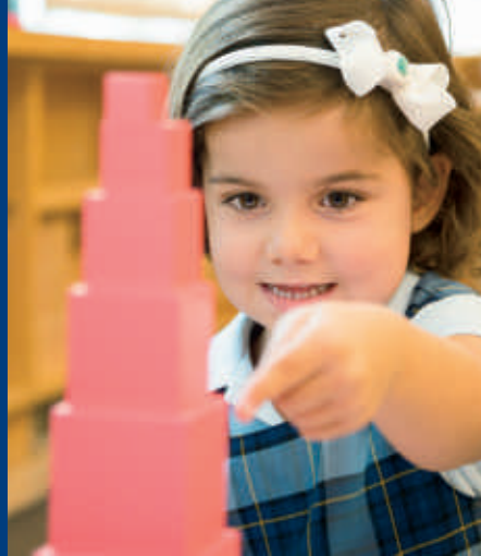
Children's House 18 Months–6 yrs