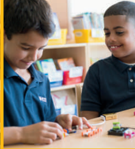
Lower School Grades 1–4